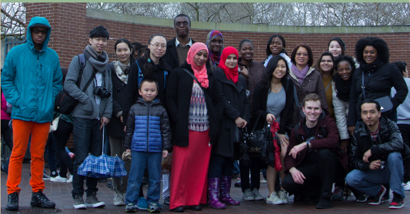
The Statue of Liberty and Ellis Island April 3, 2015