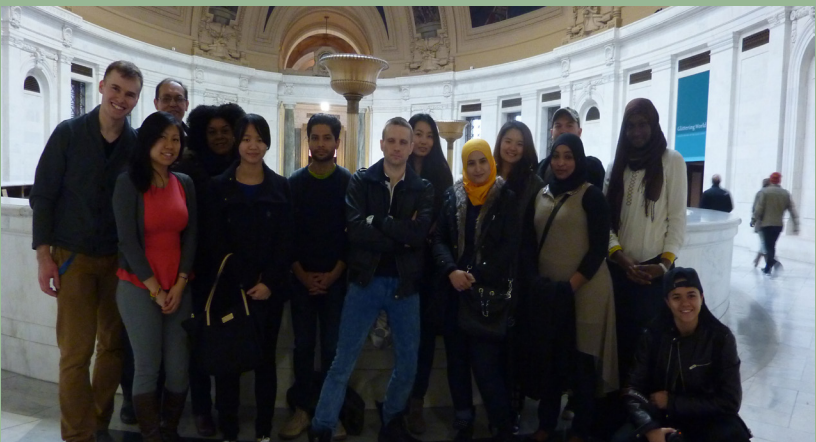
National Museum of the American Indian March 13, 2015