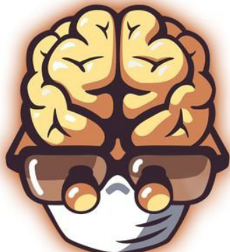
BrainBook Logo, http://www.realbrainbook.co.uk

Throughout these past couple of years as an RN, I have made strides to benefit the medical community. For example, I published a research paper regarding specialized physician shortage in rural communities in the IJSRP, an international journal for scientific research. I have also assisted in creating a non-profit organization named Scientissimum, an internationally connected internet group comprised of medical students, pre-medical students, and doctors. Scientissimum's objective