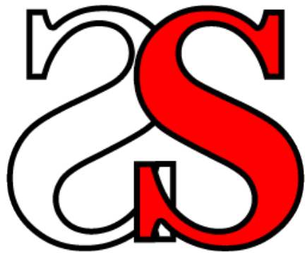
Scientissimum Logo, https://www.scientissimum.com

After taking part in the procedure, I found the stem cell injections significantly improved my level of functioning, pain, and quality of life. I was finally able to accomplish previously impossible tasks with ease. As a result, I quickly began to see the importance of medicine and the amazing effects it could have on others. I decided I wanted people to experience the same life-changing effect medicine