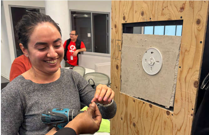
Volunteer learning to install a smoke detector