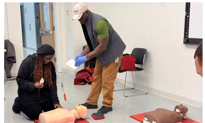
Hands Only CPR, American Red Cross October 30, 2025