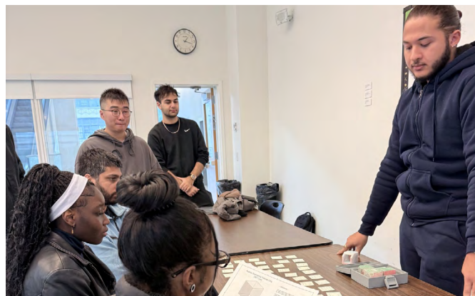
Game Jam: Going gold November 13, 2025