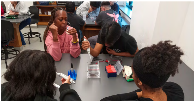
DNA Fingerprinting September 25, 2025