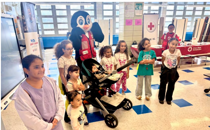
Pedro the Penguin