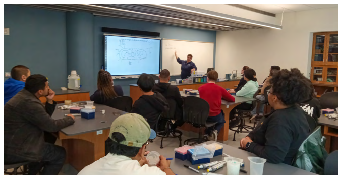
Glowing Genes October 16, 2025