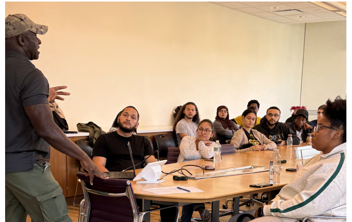
Disaster Preparedness, American Red Cross September 11, 2025