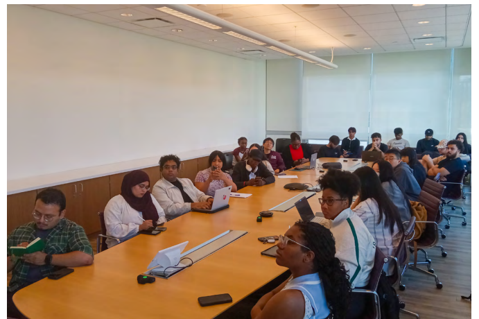
Quick Tip, Big Impacts: Mastering the M.Eng. Application Essays, Cornell University September 18, 2025